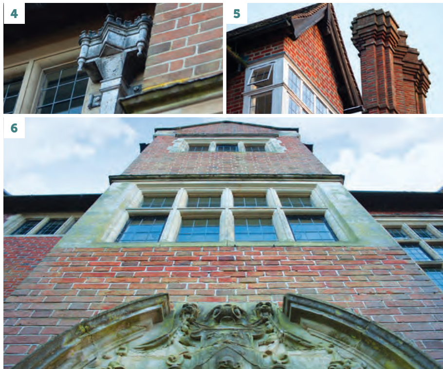
PHOTOS: 1: The Manor; 2: Entranceway stone lions; 3: South aspect; 4: Battlement hopper; 5: Elizabethan style chimneys; 6: Front façade.

Discreet and generous parking, a convenient passenger lift to all floors and the inclusion of individual boot rooms on the ground floor for every apartment will make ownership an effortless and pleasurable endeavour.