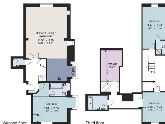
7 The Hyde, Slaugham Manor, Slaugham Gross internal area (approx) 180.2 sq m/ 1,939 sq ft

For identification only - Not to scale © Trueplan (UK) Limited