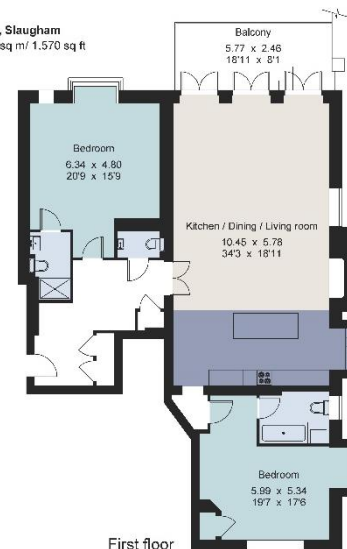
4 The Dencombe, Slaugham Manor, Slaugham Gross internal area (approx) 145.9 sq m/ 1,570 sq ft

For identification only - Not to scale © Trueplan (UK) Limited